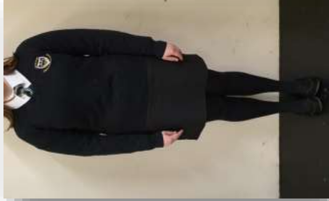
Tailored black skirts with the length coming to just above the knee.