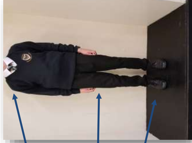
Tailored trousers, not too tight, made of appropriate material.